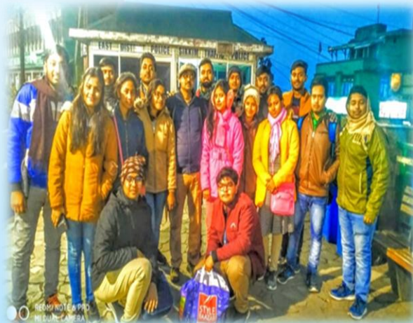
Educational tour with UG students

The Department of Botany, Krishnagar Government College came into existence in the year 1984. Initially the department used to offer Botany only as a General subject. Later on the Department of Botany began offering the subject to students of Undergraduate Honours as well as Pass course. Effective from the 2018-19 academic session, the Department of Botany in concurrence with University of Kalyani directives following UGC guidelines, started functioning under the CBCS Mode. The department besides offering Honours course in Botany offers Botany General Course to the other Honours students. The department is privileged to have extremely dynamic and dedicated faculty members who have made notable contributions in their own fields.