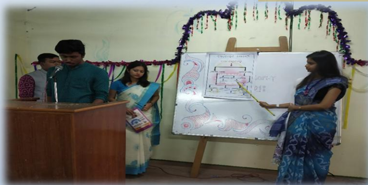
Celebration of World Philosophy Day

The primary endeavour of the department has always been enkindling young minds to the point that they engage in critical discussions on topics relevant to the discipline. Following the global trend in academia, interdisciplinary thinking is promoted by means of special lectures, invited lectures and seminars organized from time to time. Through rigorous academic training and critical thinking, our students have become capable of exploring a wide range of career choices, glorifying their alma mater through significant contributions in fields such as academics, administration, social service and others.