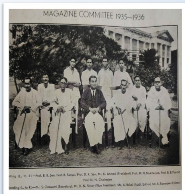
Some notable Alumni and teachers of our College

A number of ex-students of this college have become renowned personalities. There is an Alumni Association in this college consisting of the ex students. This association is always active in proper academic and cultural development of the college.