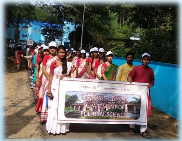
Department celebrating 175 Anniversary of our college

The Department of Political Science of Krishnagar Government College was established in the year 1952. The Department provides Honours and General Courses at the undergraduate level. The Department has successfully adopted the CBCS system introduced by the University of Kalyani and conducts its GE, SEC and DSC courses in collaboration with the departments of Bengali, History, English, Sanskrit and Geography. The Department actively participates in extra-curricular activities and boasts of a qualified, able and diverse faculty engaged in research in publication in fields such as Postcolonial Political Theory, Gender, International Relations etc.