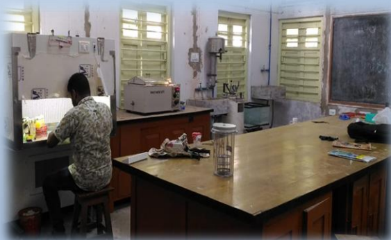
Fishery and Aquaculture Laboratory