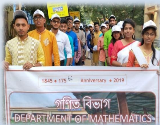
Department celebrating 175 Anniversary of our college