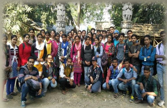
UG Educational Excursion