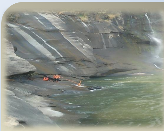
PG Educational Excursion

For further enrichment of students, the department occasionally organizes seminars on contemporary issues of the field, which are delivered by dedicated experts in the field. Also as a part of the curriculum, postgraduate students are mandatorily required to submit term papers, prepare a dissertation, and also deliver a presentation based on research that prepares them for the professional pitch. The lessons are not only confined to the college campus, but mandatory field trips are also conducted for both undergraduate and postgraduate courses, for partial fulfillment of curriculum under the University of Kalyani. Apart from producing university rank-holders consistently every year, students actively participate in extracurricular activities like dancing, singing, recitation, sports, etc. Each year at least one or two postgraduate students successfully qualify NET/SET/SLET.