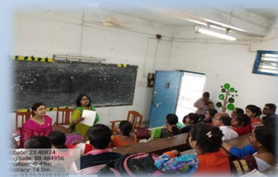
Parents Teachers Meeting , 2019