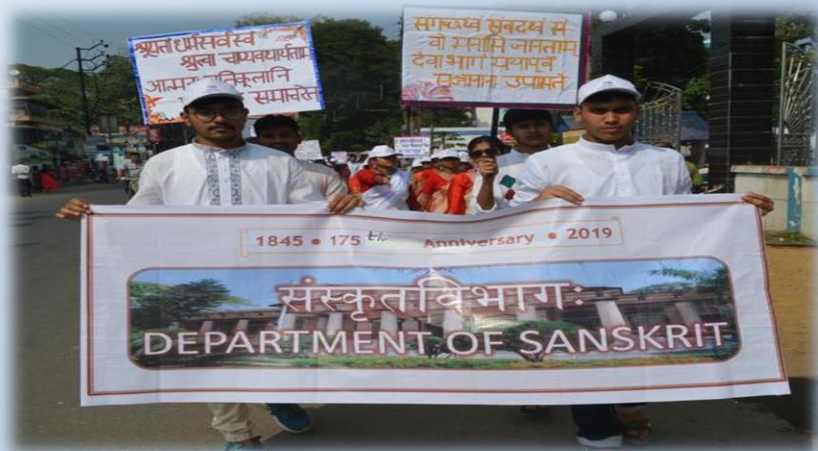
Celebration of 175th Anniversary of our College

The faculty members of the department encourage the students to approach the study of Sanskrit as the study of a subject that since time immemorial acts as an important repository of Indian cultural, philosophical and ethical values. Special care is also taken by the faculty to build up fluency in the students in speaking and writing the Sanskrit language. The department is proactive in organizing seminars and special lectures to keep the students informed about the latest trends in different fields of Sanskrit studies.