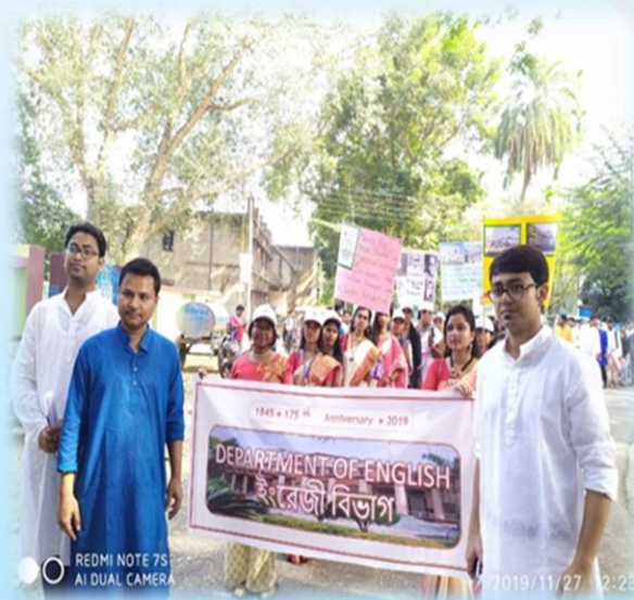
Celebration of 175th Anniversary of our College

The Department of English is one among the four (English, Sanskrit, History, Philosophy) inaugural departments with which Krishnagar Government College began its journey in 1846. At present the department offers Undergraduate Honours and General courses. Since the introduction of CBCS in 2018, emphasis has been placed on making students acquainted with world 'Englishes' in a globalised scenario, besides maintaining critical focus on literature from the British isles. ELT, Linguistics and Skill-Enhancement courses have been included in the UG CBCS curriculum to familiarize students with recent trends in English studies. In its illustrious history, the department boasts of several alumni who have established themselves in prestigious positions in society, ranging from administration to academics.