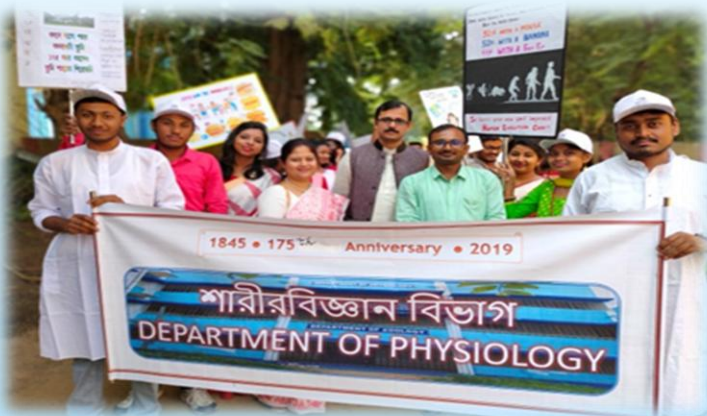
Department celebrating 175 Anniversary of our college

The Department of Physiology, Krishnagar Government College, was established in the year 1988. The department initially offered Physiology as a General subject. However, UG Honours programme in Physiology was introduced in 1998. In 2018, following UGC directives, the department rolled out the Choice Based Credit System (CBCS).