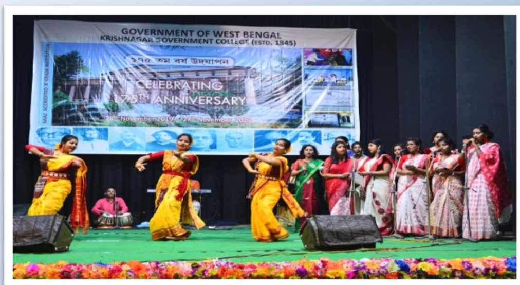
Students Participation in 175th Anniversary Celebration

*For General Courses; Physics and Zoology, Botany and Economics, Statistics and Physiology cannot be taken together.