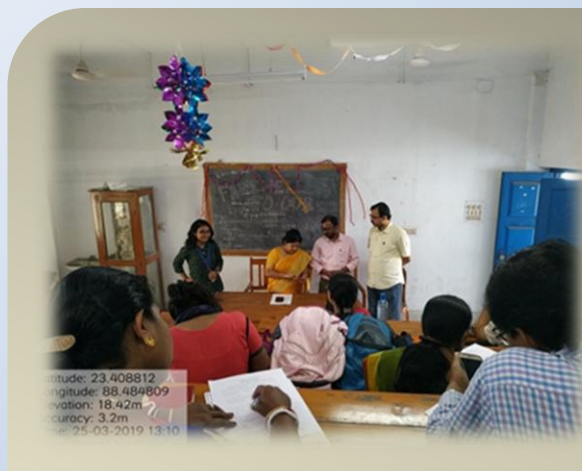
Parent Teachers Meeting, 2019

The department attempts to enhance the analytic skills of the students in an intellectual environment that is stimulating and nurturing. It provides an engagement with topics as varied as cellular basis of Physiology, biological physics and enzymes, chemistry of bio-molecules, circulating body-fluids, metabolism and nutrition, endocrinology, and reproductive function. The faculty employs learner-centric pedagogy to maximise the learning process. The students graduating from this department are well-trained either to pursue higher studies and move into the field of research or to find employment in other sectors. The students are also encouraged to participate in co-curricular activities.