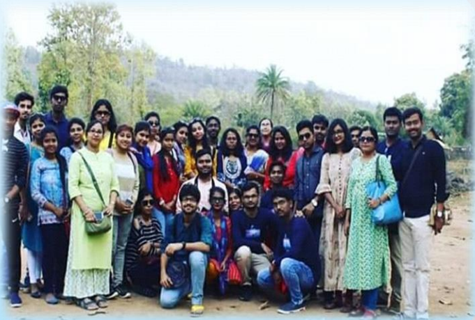
Educational tour with UG and PG students

The department of Zoology, Krishnagar Government College, commenced its journey in the year 1984. However, the post graduate course in Zoology was introduced in 2010. At present, it offers both honours and general courses in Zoology under the Choice Based Credit System (CBCS) along with offering PG course in Zoology. The department is housed at the Botany building. It occupies a distinguished place at the college due to its quality of teaching and level of research.