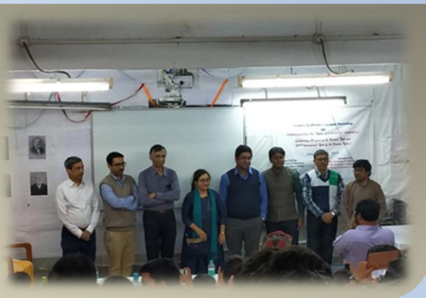
Department celebrating 175 Anniversary of our college