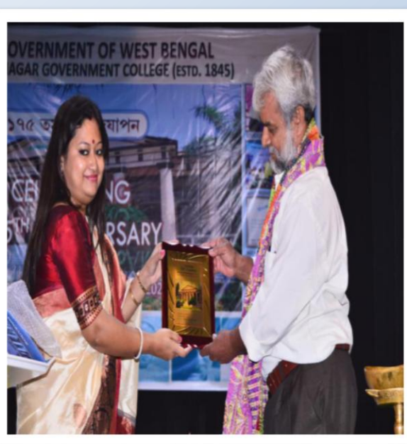
Secretary of Alumni Association being felicitated at 175th Anniversary celebration of our College