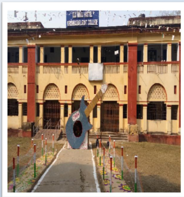
Old Hindu Hostel

The college is surrounded by vast play grounds.