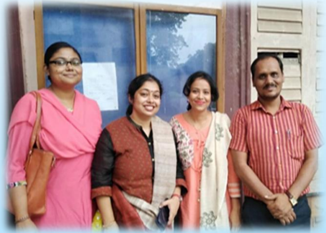
Faculty Members of the Department of Sanskrit

The glorious history of the Department of Sanskrit ranges back to 1846, when Krishnagar Government College began its illustrious journey. Currently it offers Honours and General Courses for Undergraduate courses. A major factor responsible for shaping the core of Indian culture and heritage, knowledge of Sanskrit imparts not just literary education but value education as well. This twin endeavour has been the driving force behind the pedagogic activities of the grand old Department of Sanskrit at Krishnagar Government College.