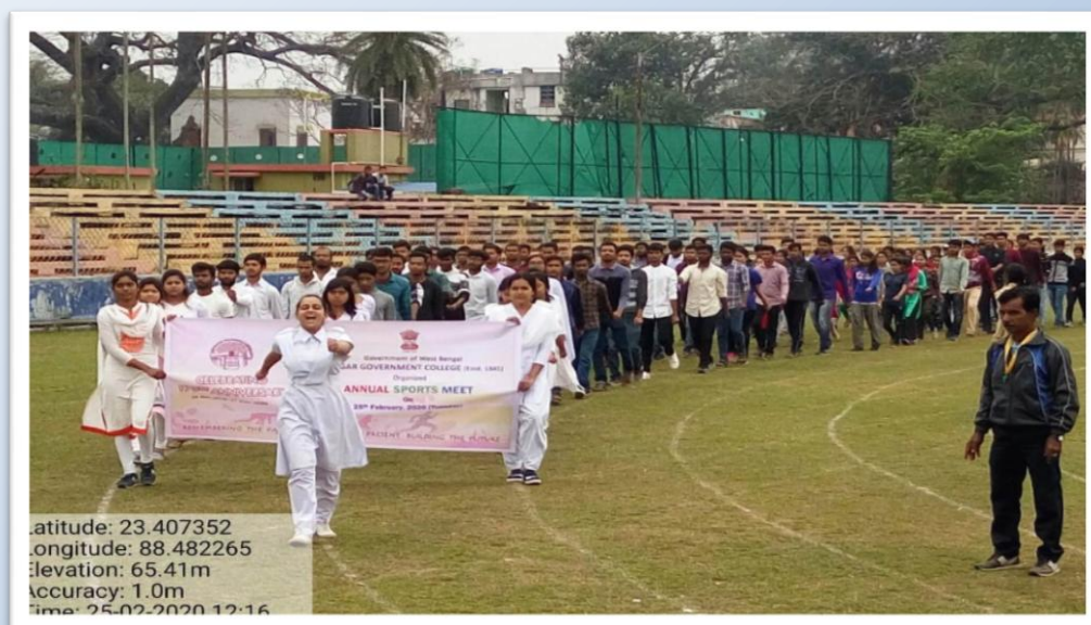
Annual Sports Meet 2020