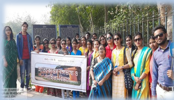
Educational tour of the Department