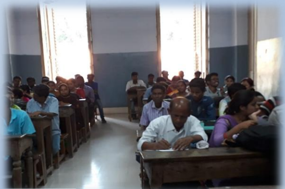
Parent Teacher Meeting, 2019