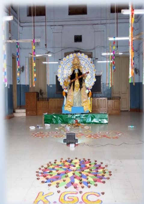
Saraswati Puja 2020