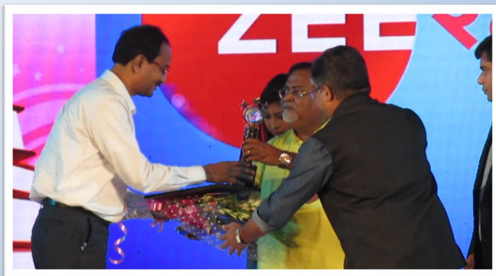
Education Excellence Award 2018