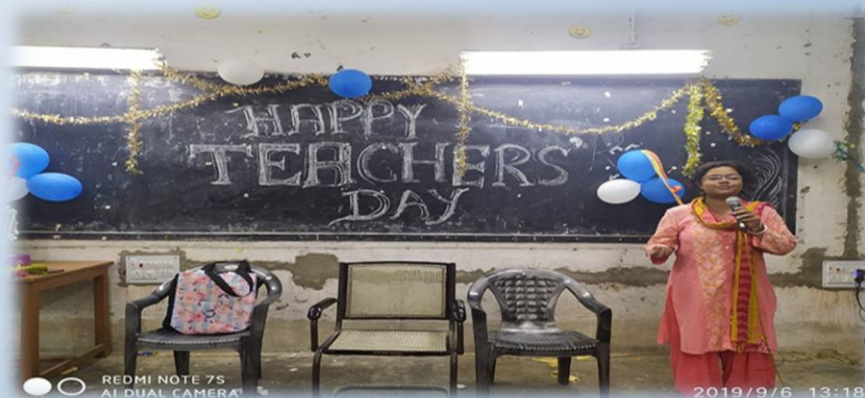
On the occasion of Teachers' Day, 2019

The department of English seeks to provide the students with a stimulating and nurturing learning environment in order to develop their critical and creative abilities. Arcadia, the wall-magazine of the department, is a platform where the students can realize their creative potentials. The classes are interactive spaces where students are encouraged to ask questions, engage in discussions and also to respect the opinions of others. The faculty takes special care in arranging tutorial and remedial classes to provide the students with valuable feedback. The department also organizes special lectures, film screenings, seminars etc. to widen the knowledge of the students.