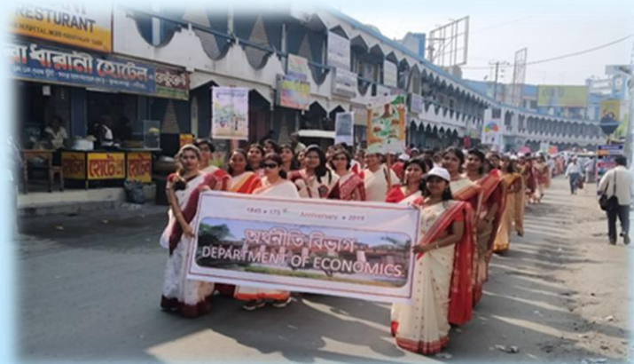
Department celebrating 175 Anniversary of our college

The department of Economics at Krishnagar Government College was established in the year 1941. It, therefore, carries with it a glorious heritage of almost eighty years. Presently, the department offers both honours and general courses in Economics under the Choice Based Credit System (CBCS). The department functions as a well-knit community of accomplished and highly committed teaching faculty and a very vibrant group of student body.