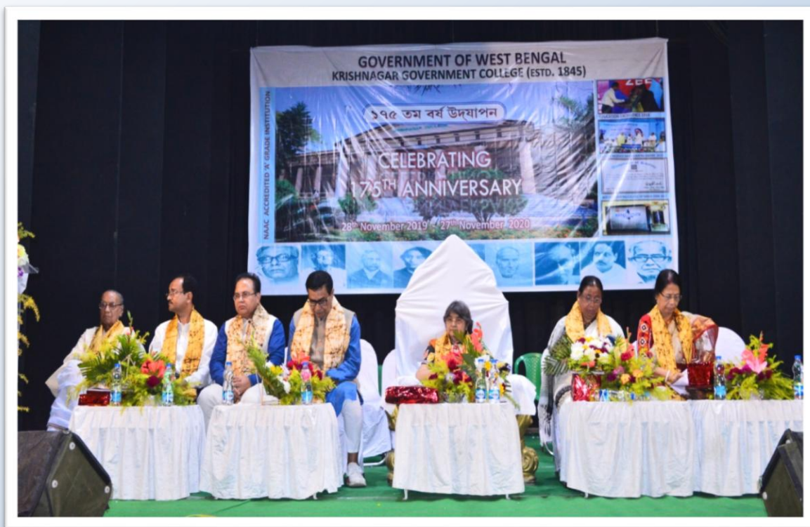
On the occasion of 175th Anniversary of our College