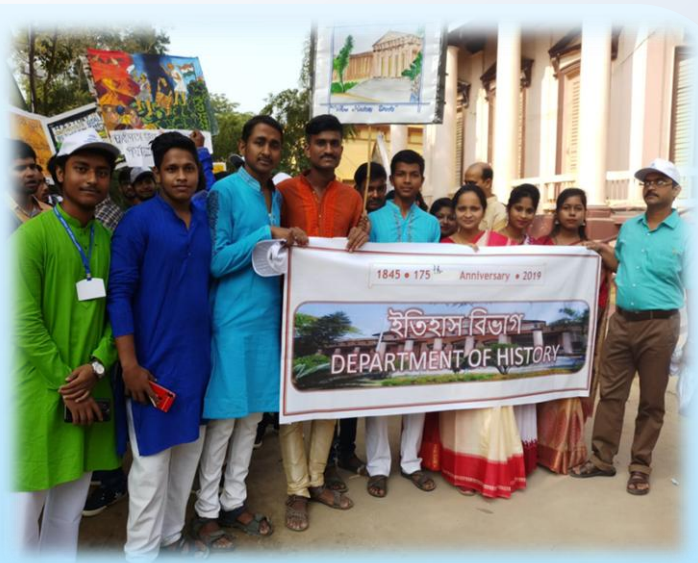
Celebration of 175th Anniversary of our College

The journey of the Department of History as a separate Honours department at Krishnagar Government college began in the year 1918. However, since the establishment of the college in 1846, history has been taught as a subject. Under the current Choice Based Credit System (CBCS), the department offers both History Honours and General courses as recommended by the University of Kalyani. The department with its rich heritage has the distinction of attracting meritorious students and has continued to produce outstanding students till date.