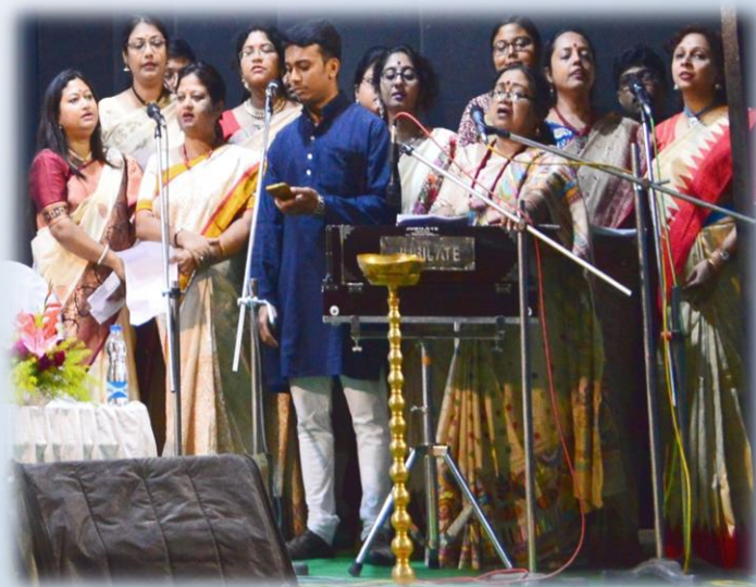
Cultural Programme performed by our teachers during 175 th years celebration

It is an actively functioning unit of the college that establishes coordination among the Principal, faculty members and other stakeholders involved in the teaching-learning process. In the beginning of every academic year, the IQAC chalks out the plan of action for the institutional development, monitors their implementations and evaluates the outcome achieved by the end of the year which gets reflected in the Annual Quality Assurance Report (AQAR). Under its leadership, the faculty members are continuously encouraged to update themselves and to impart that updated knowledge to the students. It gives emphasis upon the creation of a learner-centric environment and positively encourages the teachers for greater use of the ICT enabled teaching-learning process. It also uses the feedback received from different stakeholders to make an overall assessment of teaching-learning process in the college. The functions of the IQAC further include the documentation of various programmes/activities of the college and the promotion of quality related activities and issues through various programmes such as seminars, workshops, symposia, panel discussions etc. for all the stakeholders of the institution. It also encourages self-evaluation and accountability which are crucial for maintaining the required standard at the academic as well as administrative level of the college.