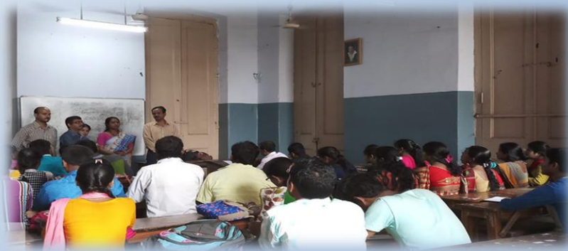
Parent Teacher Meeting, 2019

The functioning of the department is guided by the objective of developing critical and analytical thinking as well as creative skill in the students. In order to make the teacher-student interaction more effective, the faculty members remain engaged in devising new pedagogic practices. Apart from normal lectures, group discussions, tutorials, class tests, home assignments etc. are also arranged to assess the continuous progress of the students. In every academic year, a good number of students get first class in the university examinations which speaks volume of the department. Many of the students after graduating from this department have either pursued higher education in the universities and cracked exams like SET or found employment in other sectors. In order to ensure the holistic development of the students, the department positively encourages them to participate in extracurricular activities.