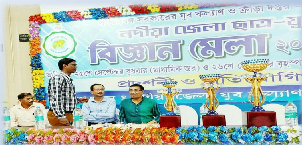
Science exhibition 2019 at College organized by Nadia District Authority