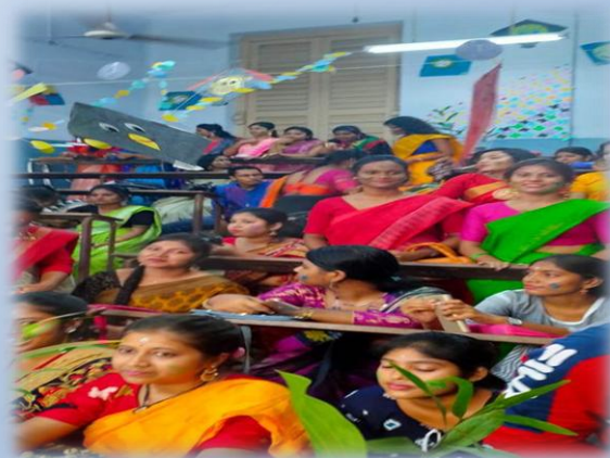
Faculty members and students at the Teacher's day celebration