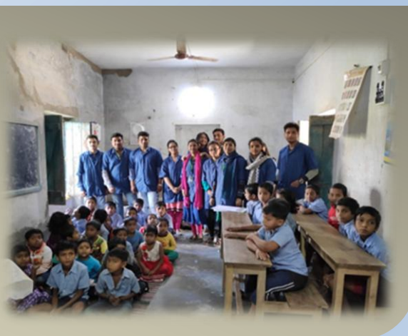
Participation of students in NSS program