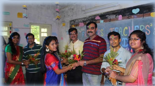
Teacher's Day Celebration, 2019