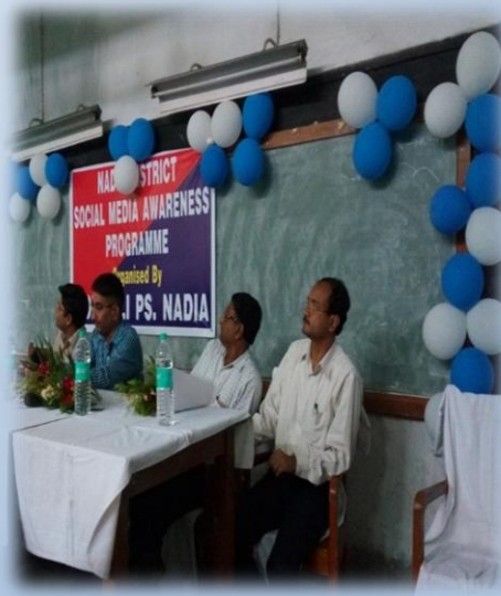
Social Media Awareness Programme