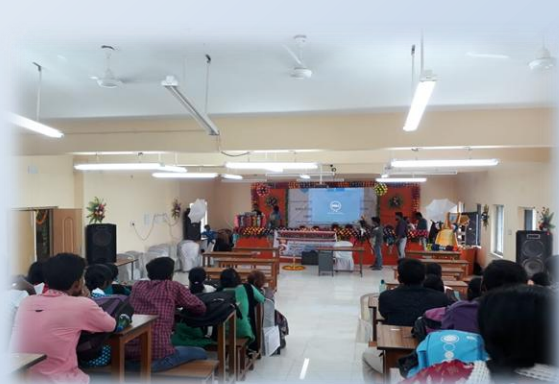
Youth parliament competition at MGC

Political Science is principally a theoretical subject at the undergraduate level. However, the department attempts to instill a sense of context and perspective in the minds of the students by frequently resorting to activities such as the Youth Parliament, National Voter's Day observation and frequent participation in subject-related quiz contests, extempore etc. to keep their interest alive in the subject. Parents-Teacher meetings are organized to keep the parents abreast of their ward's activities inside the college. Academic as well as professional careers of several students from this department testify to its strength. In the recent past, the department has witnessed many of its students pursuing further study and research at eminent institutes of the state as well as the country.