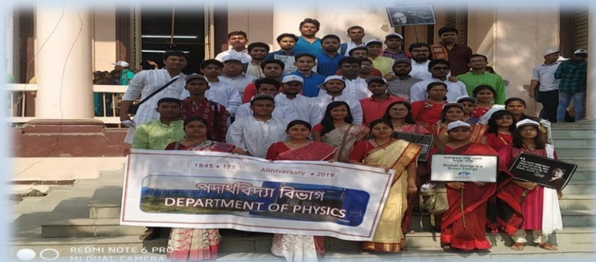
Celebration of 175th Anniversary of our College

As the department constantly strives for attaining academic excellence, it promotes original thinking among the students and also encourages them to move beyond the syllabus-centric study. The fact that most of the students of the department get more than 60% of marks in their university examinations, proves the effectiveness of the teaching methods followed in the department. The department also takes pride in its alumni who have excelled in different fields.