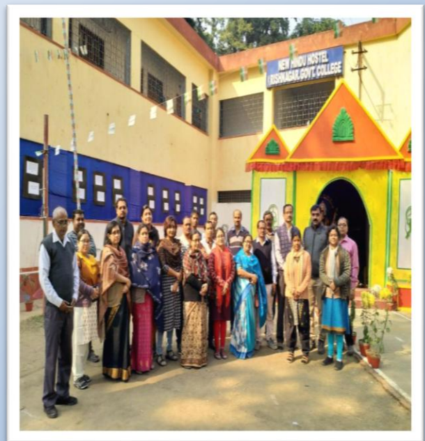
New Hindu Hostel