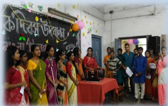
Teacher's day celebration

Faculty members at the Department of Bengali are ever-aware of their important role in sustaining the glory and the heritage of the venerable institution. As language teaching and literary studies become increasingly enmeshed in the matrix of culture studies in a globalized scenario, the Department of Bengali responds to the need of the hour by incorporating more and more technology-based pedagogic practices in the language learning classroom. Significant among others is the introduction of the LCD projector, utilized regularly to exhibit films relevant to the syllabus. The department periodically organizes invited lectures to better orient the students. To promote the research activity among students seminars and conferences are regularly organized, besides publishing their work in the College Journal. Regular visits to places of literary interest and historical importance are arranged for empirical enlivening of bookish knowledge. The department aims to empower the students with relevant knowledge, competence and creativity to face the challenges in different spheres of their life.