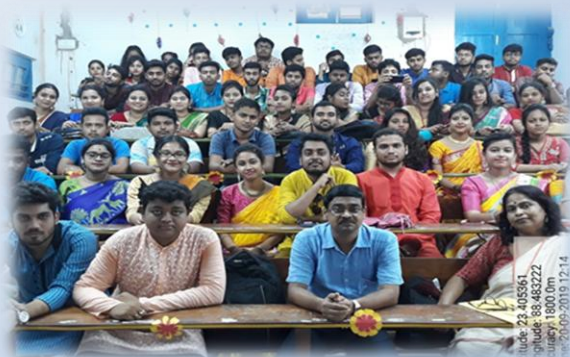
On the occasion of Teachers' Day, 2019

The department of Botany tries to ensure for the students an energetic learning environment that would hopefully foster stimulate them to indulge in original scientific thinking. Seminars, Workshops, Special Lectures graced by the presence of eminent personalities related to the discipline are organized by the department from time to time, with the objective of boosting the inquisitive temper of the students besides acquainting them with the latest developments in the field. A major impetus of the department is the promotion of interdisciplinary learning, simultaneously endowing the students with requisite skills, thus empowering them accommodate themselves in different sectors of our ever-changing society. Several alumni of this department have established themselves in diverse fields ranging from academics to administration. The intention of the department is to maintain the high standard it has set since its inception, banking on sincerity, devotion and co-operation.